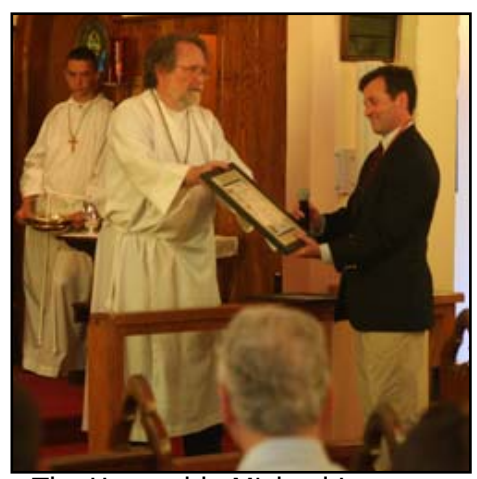
The Honorable Michael Lavery, Mayor of Hackettstown