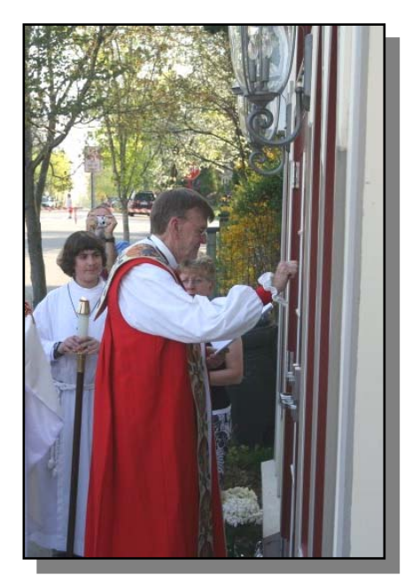
The Opening of the Doors Dedication Sunday