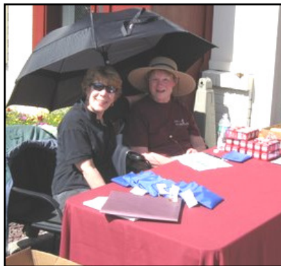
For shade, not rain