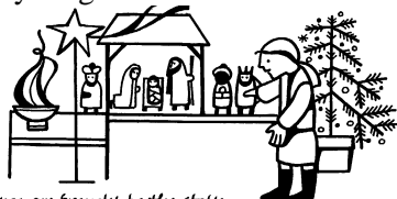
The Kings are brought to the stable.