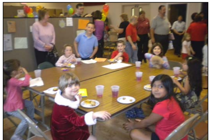
and a party afterwards

For Weekly Announcements and what's happening at St. James', visit our Webpage: