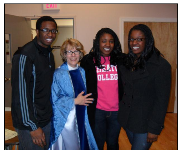
The Okoyes home from college.