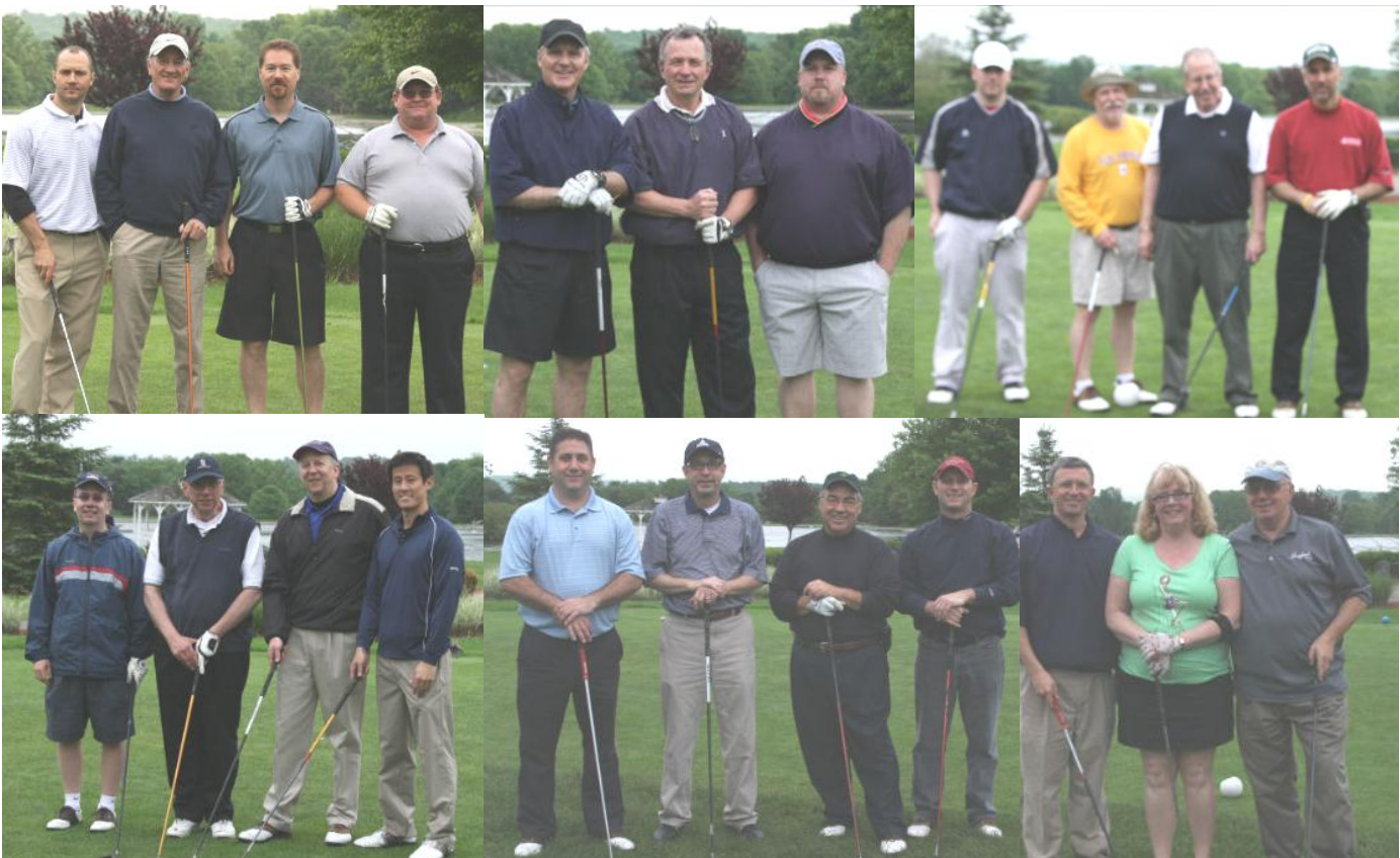
Team 1Pequest Fish Hatchery Team