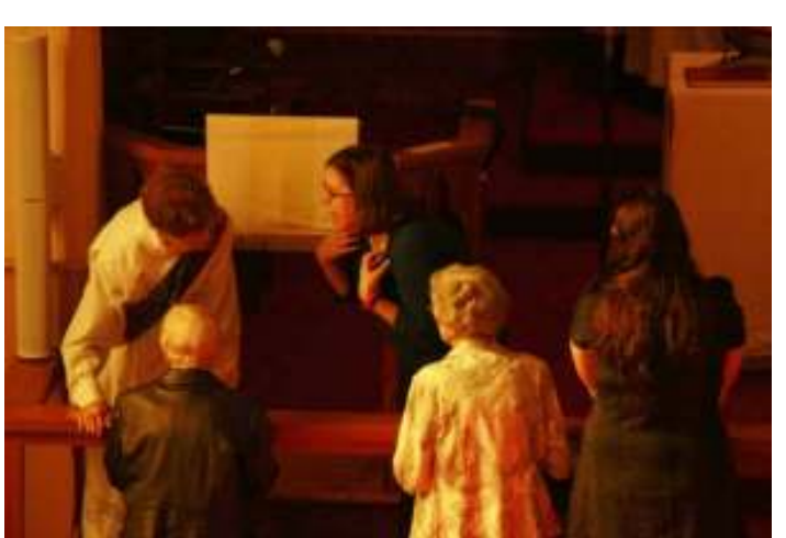
FEAST OF ST. LUKE HEALING SERVICE