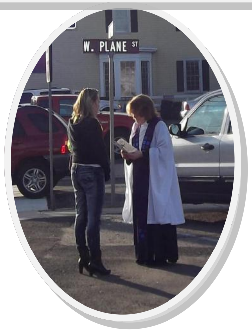
In Christ's Name