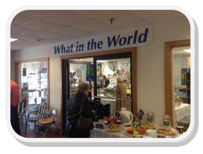
Feeding Giving Caring