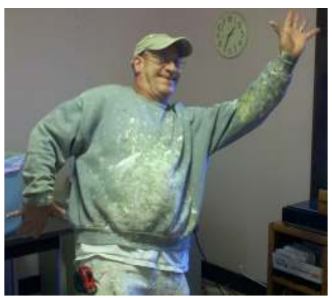
In Christ's Name