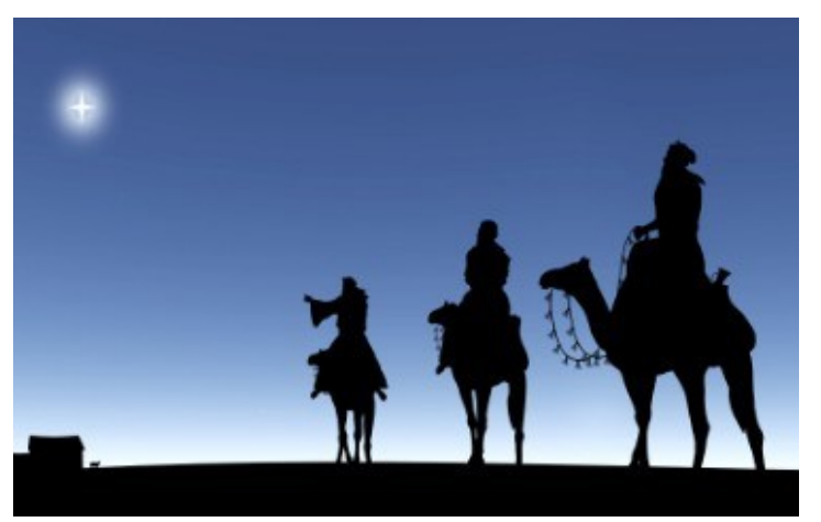
Mark Your Calendar Boar's Head—Epiphany Dinner Our annual dinner will be held on January 9th,

Watch for more details in the days ahead!