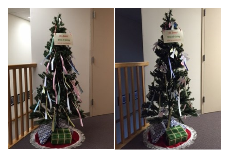
The Sunday School children added beautiful hand-made angels to the Tree of Giving!