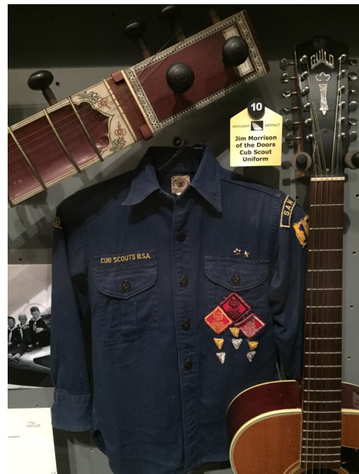
Jim Morrison's (of the Doors) Cub Scout Uniform at the Rock & Roll Hall of Fame in Cleveland, OH