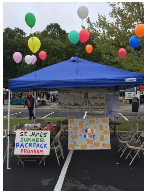
St. James' booth at Community Day on October 1st.