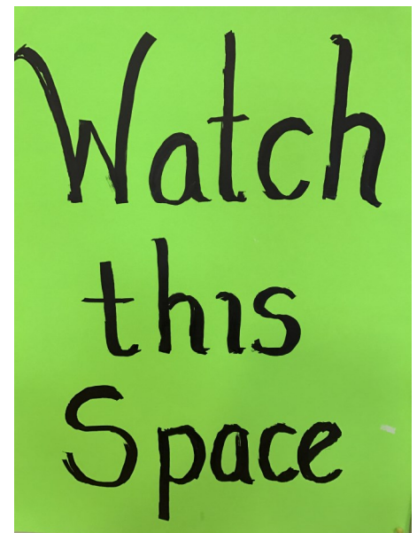
Look for this sign in the Parish Hall!