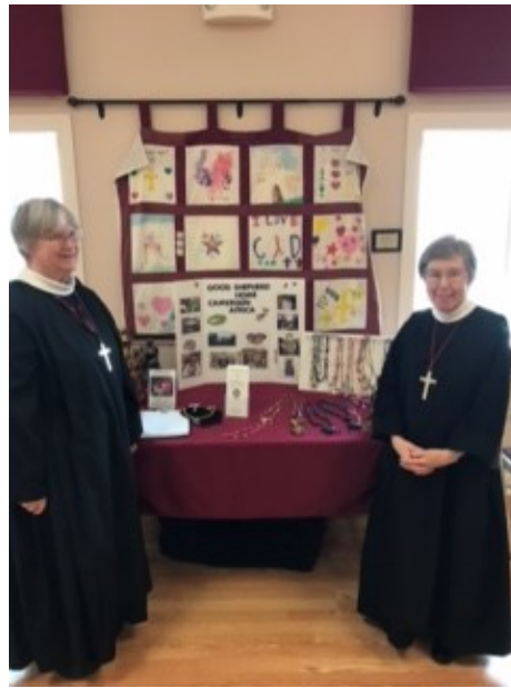
Sisters from St. John Baptist visited St. James' on October 23rd